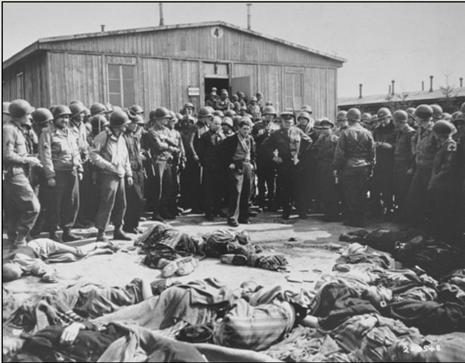
General Dwight D. Eisenhower views the victims of the Ordhuf camp April 12, 1945